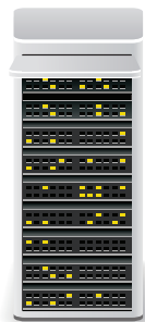
Yealink RPS Server

The Yealink T4S supports efficient provision and effortless mass deployment with Yealink's free Redirection and Provisioning Service (RPS). Furthermore, the T4S features a unified firmware and an auto-p template that apply to all phone models (T41S, T42S, T46S and T48S), saving even more time and IT costs for businesses.